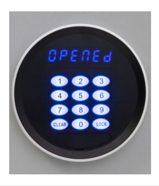
Electronic Key Safe 38 Keypad