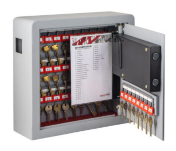
key 38 wide